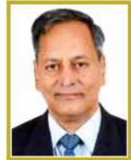
Shri Ravi Toshniwal