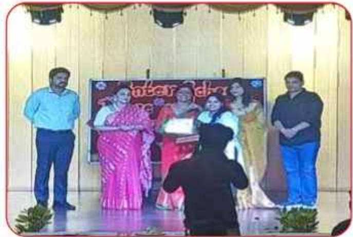
Solo Song Competition (24.08.2024)