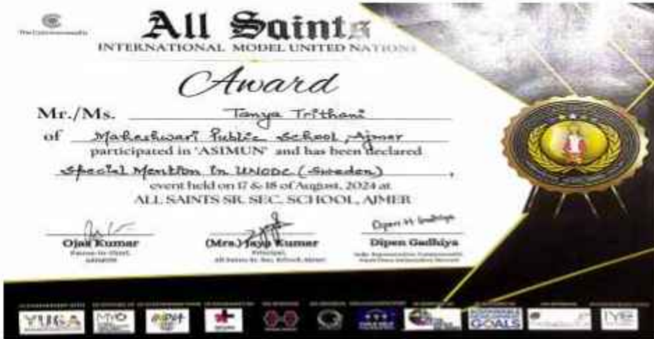
Model United Nations (17 and 18 August 2024)