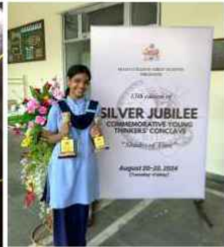
Silver Jubilee Young Thinkers Conclave (21 August to 23 August 2024)