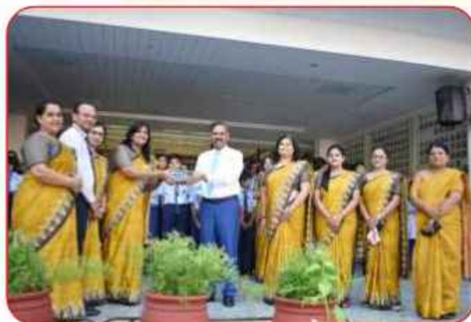
Initiative of Using Pink Pen for Note-Book Correction