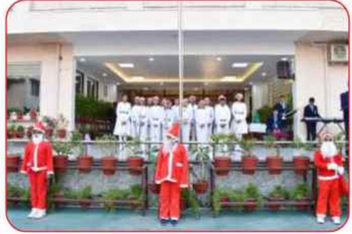
Christmas Day Celebration