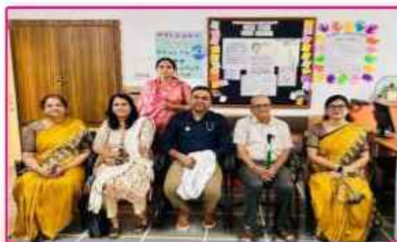
HEALTH CHECK UP CAMP