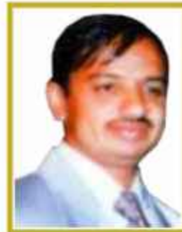
Shri Vishnu Gopal Somani