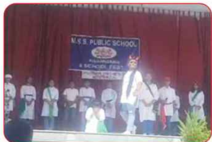
Nukkad Natak (Play) Competition - H.K.H. School - (31.08.2024)