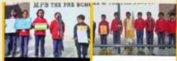
Show & Tell Activities