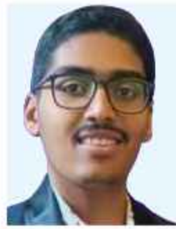
PRINCE BHARADIA 99.00%