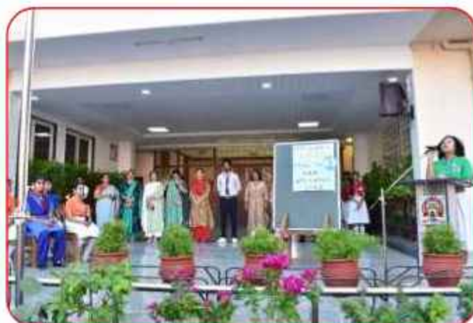
Introduction of Health and Wellness Club & Role of Health Ambassador in School