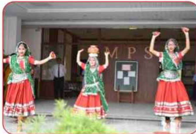
Inter-School Winning Dance Performance Presented in Assembly