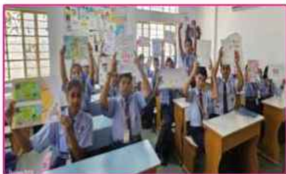
STOP CHILD ABUSE