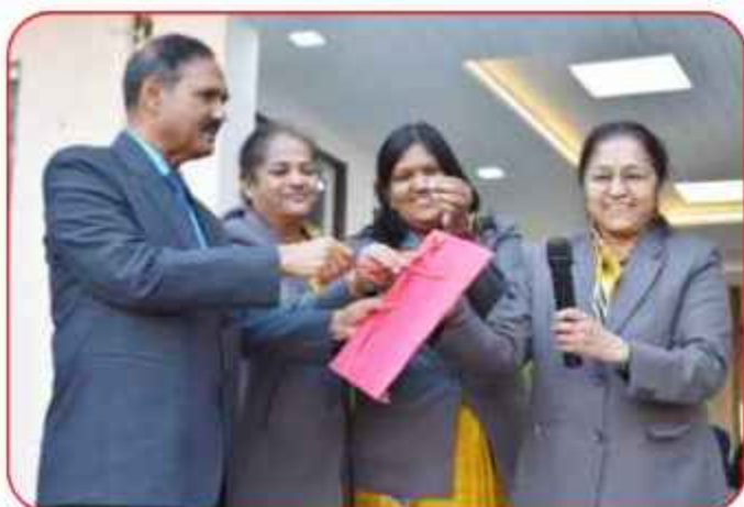
Book Launch of The Budding Writer's of M.P.S.