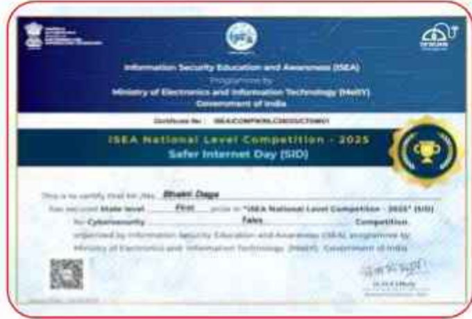
National Level Competition on 'Safer Internet Day' (10.08.2024)