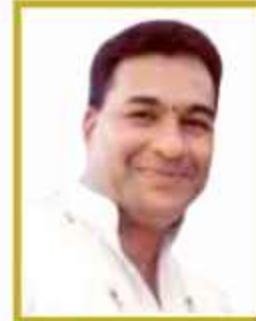
Shri Ashok Toshniwal