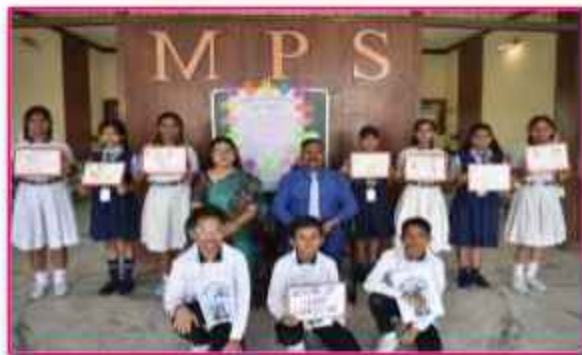
GLOBAL HAND WASHING DAY