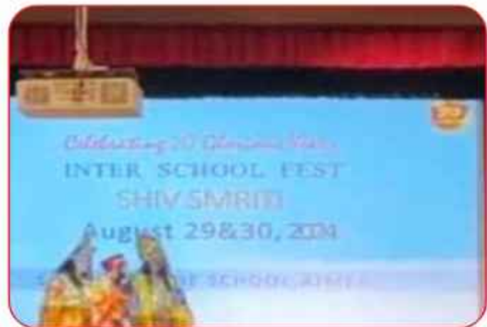
Sampravah - Hindi Play Competition - Sanskriti - The School (29.08.2024)