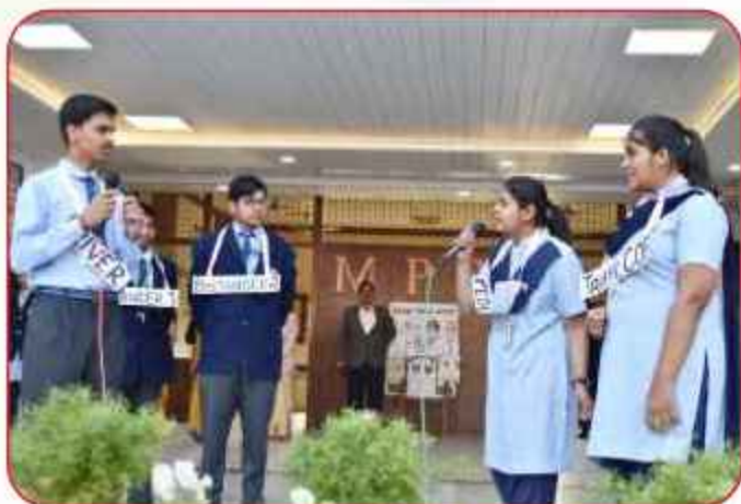
Traffic Safety Rules