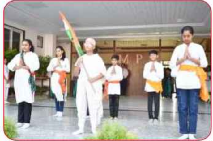
Gandhi Jayanti Celebration