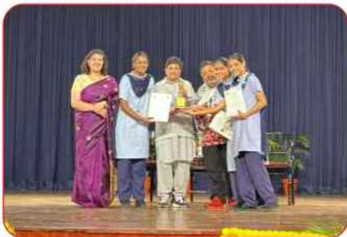
English Drama Competition Silver Jubilee Young Thinkers Conclave Mayo Girl's College, Ajmer