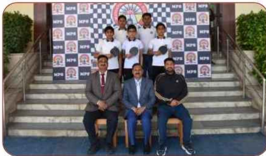
Table Tennis U-14 Boys