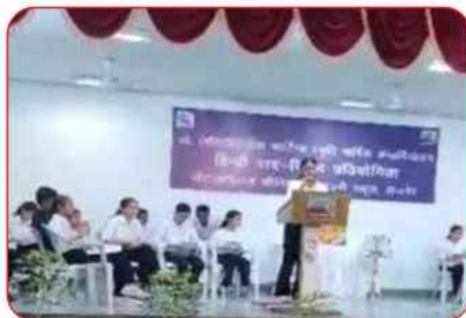
Debate Competition (Hindi) - Mayo College Girls School (22.08.2024)