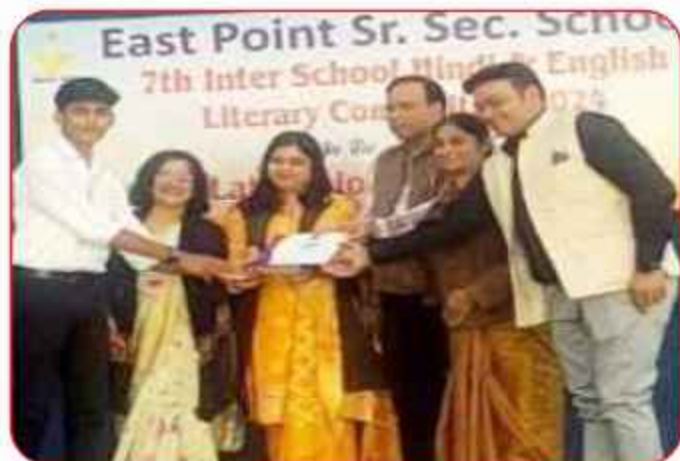
East Point Sr. Sec. School, Ajmer (21.11.2024)