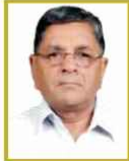
Shri Om Prakash Porwal