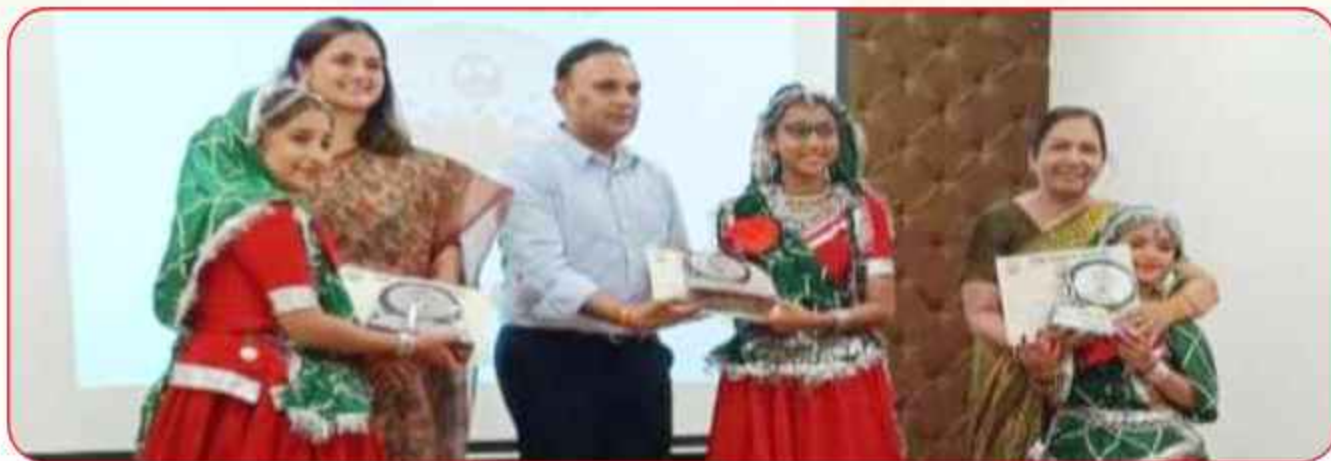
Trio Dance Competition (22.08.2024)